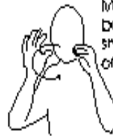
Hot air balloon

Mime blowing up balloon. Right hand shows size and shape of balloon